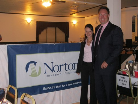
Norton Insurance · Financial